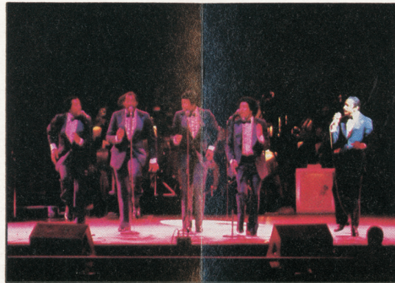
The Temptations, August 10