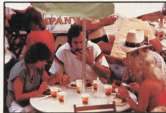
Food from 50 restaurants