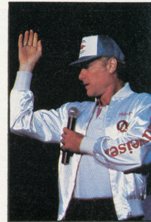
The Beach Boys, August 13