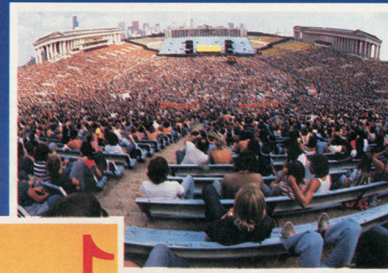
Live Concert At Soldier Field

August 10-14 and 18-22 Opens 12 Noon each day