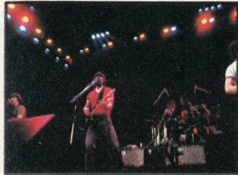
Alabama, August 20

Main Stage (To Be Announced) Son Seals Tompall & the Glaser Bros. Shadowfax David Clayton-Thomas