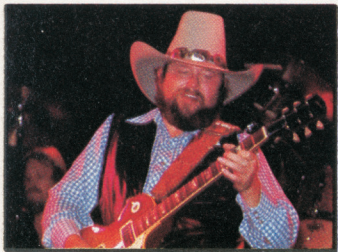
Charlie Daniels Band, August 12